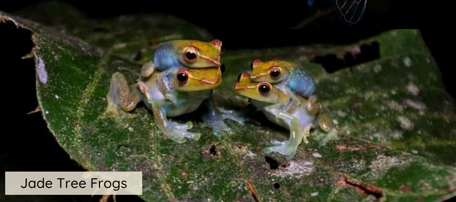
Jade Tree Frogs