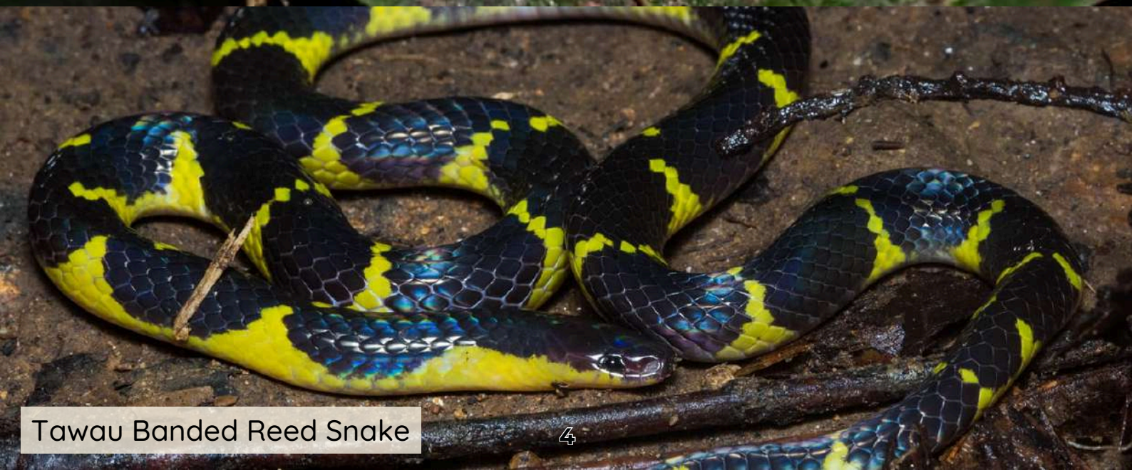
Tawau Banded Reed Snake